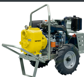
VAR 2-180 D TROLLEY - E