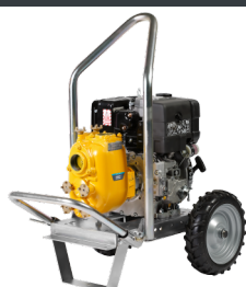
VAR 2-180 D TROLLEY - R